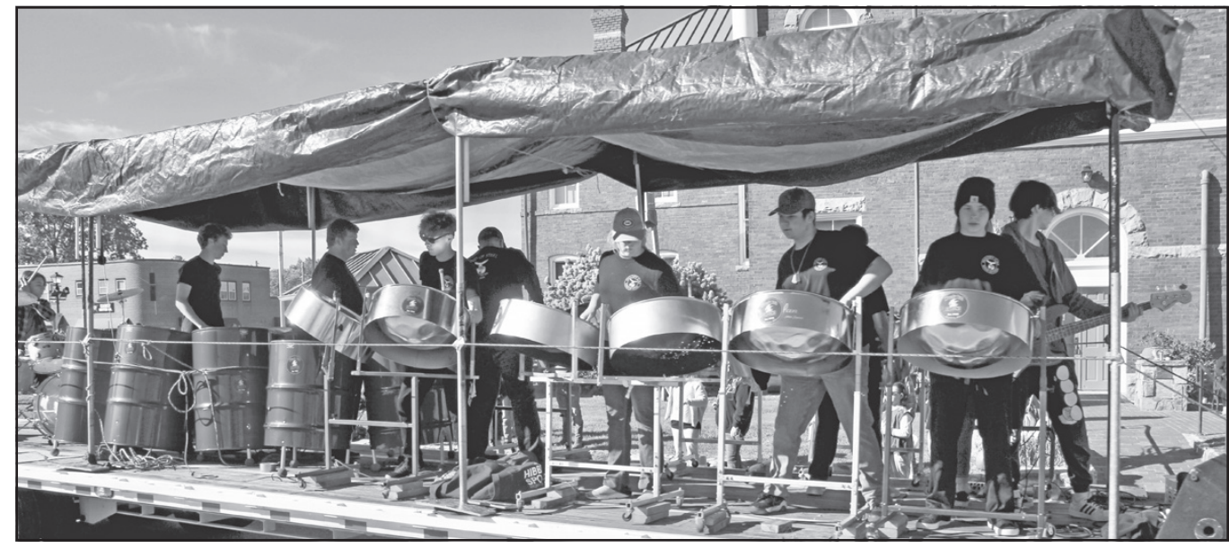
The Woody Gap Band of Steel won "Best In Show" for the 2022 Blairsville Sorghum Festival Parade in Downtown Blairsville Oct. 8.

The Blairsville Sorghum Festival Parade on Saturday, Oct. 8, was a major community success after returning from a 2021 hiatus due to lingering concerns over the potential spread of COVID-19.